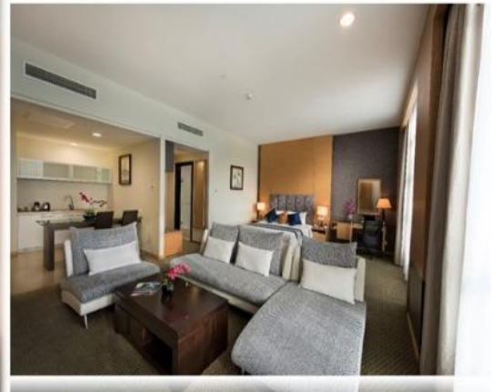
Premier Suite @ RM496.50nett