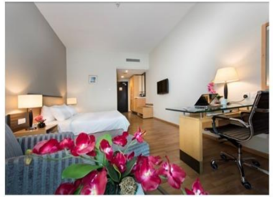
Deluxe Twin/Double @ RM150.00nett